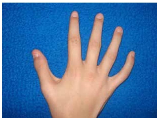
Figure 2b. Onychodysplasia