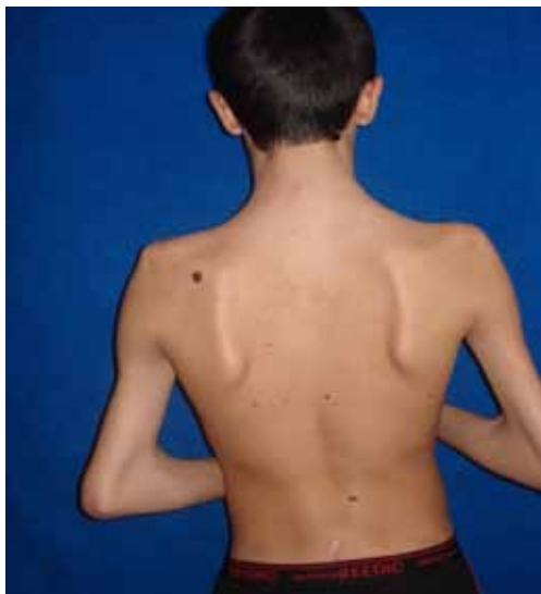
Figure 4b. Scoliosis, hypoplastic upper arm muscles