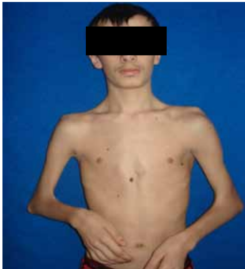
Figure 4a. Deformed chest, hypoplastic upper arm muscles