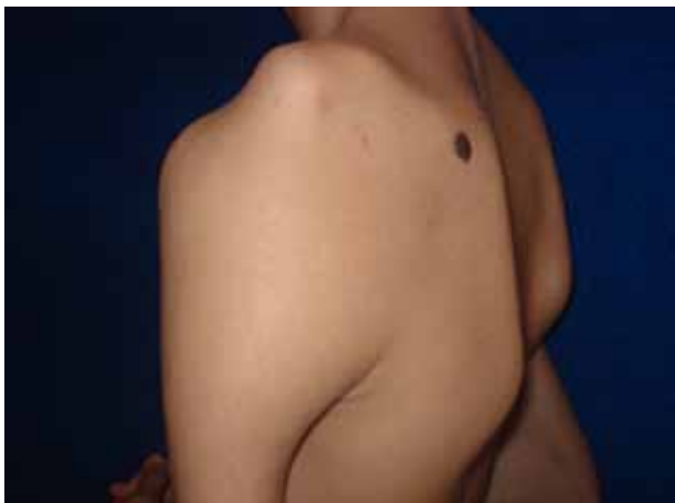
Figure 5. Left shoulder subluxation

Skeletal X-rays performed confirmed the clinical findings (fig 6, 7, 8).