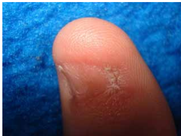
Figure 2a. Onychodysplasia of the thumbnail

The patient also presented onychodysplasia, especially of the thumbnails (fig 2a, 2b), bilateral absence of patella (fig. 3), deformed chest, scoliosis, hypoplastic upper arm muscles (fig. 4 a, 4 b), left shoulder subluxation (fig. 5).