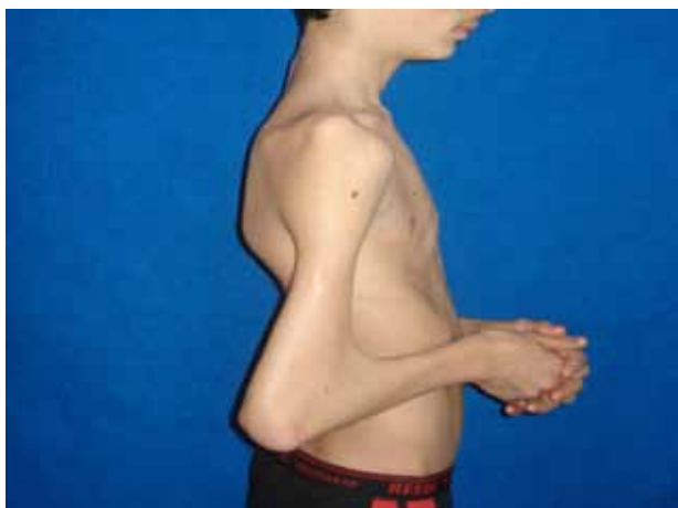
Figure 1a. Elbow malformation, the forearms at 90° flexion, with limitation of the extension

His present physical examination showed normal height for his age with lower body mass index, elbows in flexion at 90°, with impossible further extension, the skin and the underlying forearm flexor muscle form a stretched cord which limits the extension (pterygium antecubital) (fig 1a, 1b).