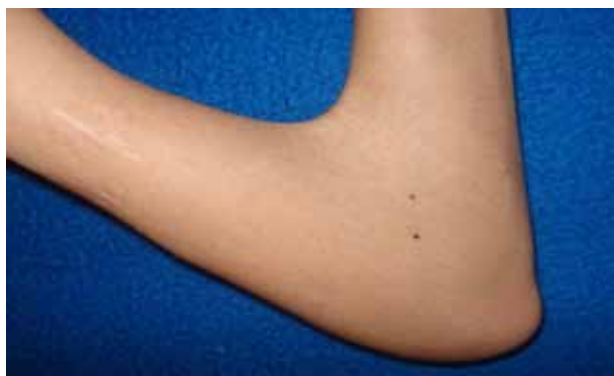
Figure 1b. Pterygium antecubital

The patient also presented onychodysplasia, especially of the thumbnails (fig 2a, 2b), bilateral absence of patella (fig. 3), deformed chest, scoliosis, hypoplastic upper arm muscles (fig. 4 a, 4 b), left shoulder subluxation (fig. 5).