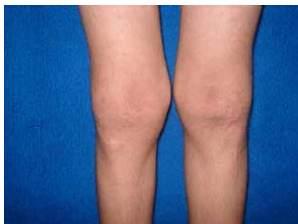
Figure 3. Bilateral absence of patella