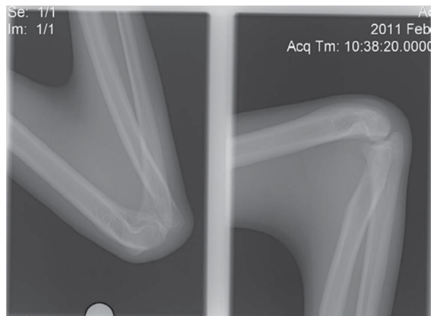
Figure 7. Upper Arm X-Ray – elbow in flexion, at 90°, with impossible further extension, the skin and the underlying flexor muscles of the forearm form a stretched chord.